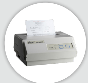
Wireless printing via Bluetooth