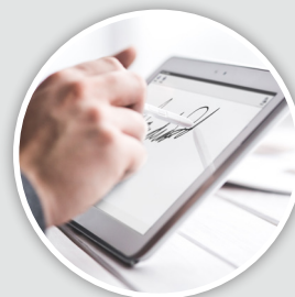
Order confirmation with the client signature

It is allowed to perform all the functionalities from a tablet (routes, pending collections, check stocks, invoicing...) with 4G, and it is operative without data connection. It reduces the waiting time between the order and the service.