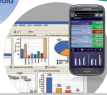
Board of directors and management