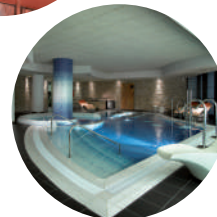
SPA and Thermal Center