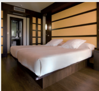
Meeting & Events management