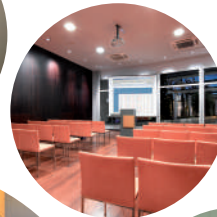
Events and Banquets