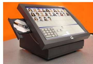
CD ROM reader unit or DVD writer