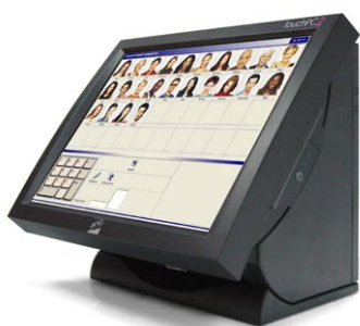
Support for vertical position