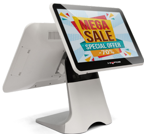
13.3" second screen